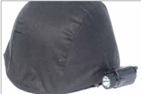
You can adjust the light left or right.