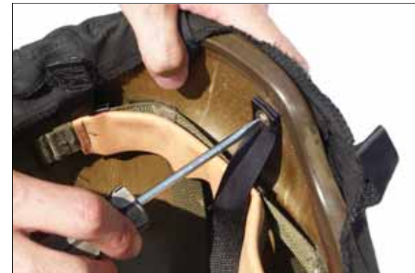
Step 3 - Remove the Chicago screw securing the chin strap on the weak-hand side of the helmet. Retain the Chicago screw for later use.