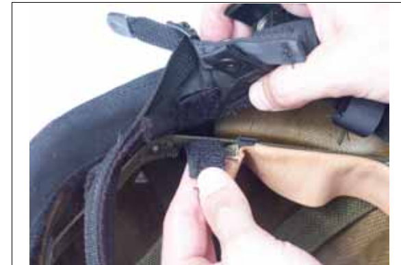
Step 2 - Remove the helmet cover.