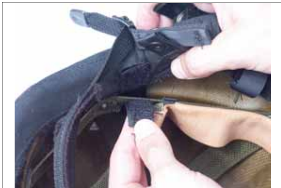
Step 13 - Re-secure the helmet cover.