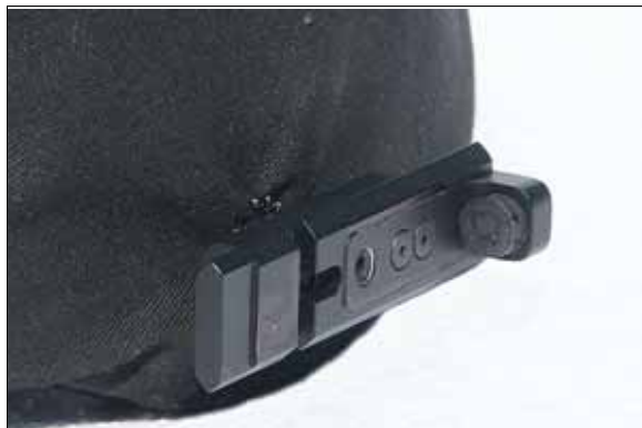
PASGT Helmet Mount

Never disassemble LIGHTLINK products. LIGHTLINK contains small parts & springs that may cause injury if improperly released. If repairs or adjustments are required, return your LIGHTLINK product to Mounting Solutions Plus.