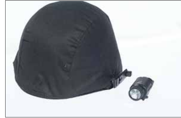
Installation Is Complete!