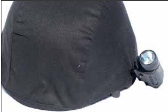
You can adjust the light to point up or down.