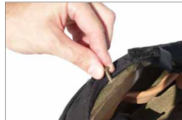
Step 4 - Remove and discard the chin strap screw.