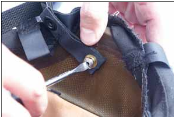
Step 12 - Tighten the Chicago screw firmly .