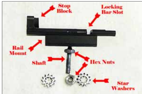
Step1- Familiarize yourself with the parts.

Note: The instructions depicted here apply to mounts for right -handed users, requiring mounting on the left side of the helmet. Mounts designed for left -handed users will be installed in an identical, or mirrored, manner on the right side of the helmet. It is critical that the helmet mount is installed on the weak-hand side of the helmet to ensure it does not interfere with the stock of a weapon mounted to the strong-hand shoulder.