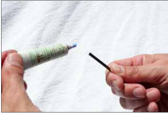
Step 11 - Place blue Lock-tite on a small wire, and then transfer it to the inside of the Chicago screw removed in Step 3.